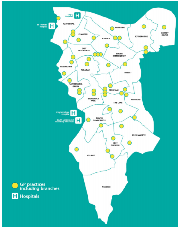
Figure 1: GP surgery locations across Southwark

There are currently 41 GP contracts over 42 sites, and 3 sites which have multiple practices: Borough Medical Centre, Lister Primary Care Centre and St Giles Surgery. The largest GP practices, Nexus, covers the north of the borough and has 58,000 registered patients.